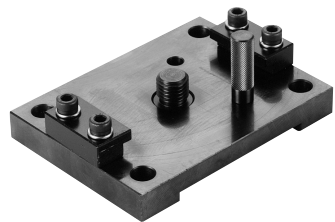
Table of Components